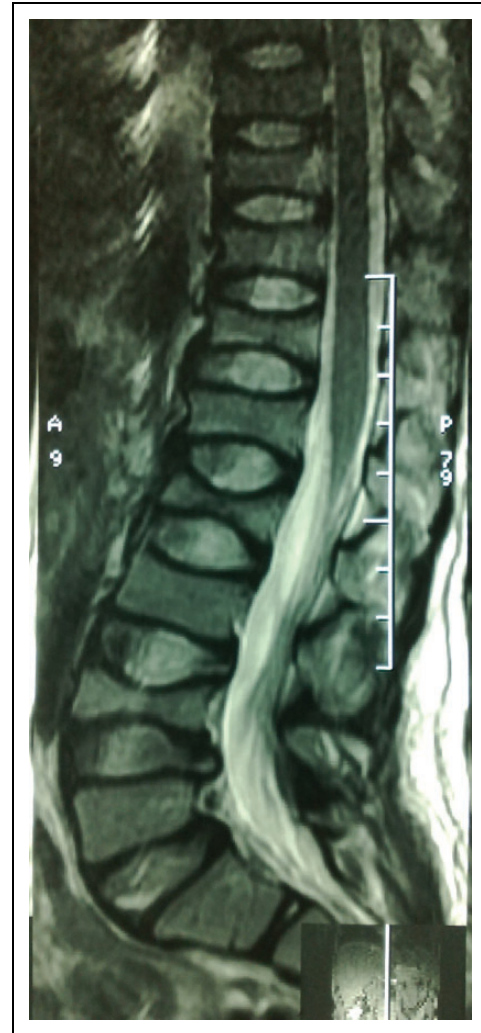
Figure 2. Degenerative changes in lumbosacral vertebrae.

The clinical manifestation of CBS deficiency is diversely heterogeneous; however, 4 organs are dominantly affected, namely “central nervous system, eye, skeletal, and vascular system.” 6 These patients are often normal at birth. Homocystinuria, due to CBS deficiency, usually manifests itself as ocular lens subluxation, which results in severe myopia and iridodonesis. In a large number of patients, ectopic lentis occurs by the age of 8 years. 4,7