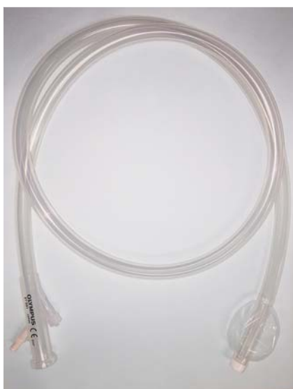
Fig. 1 Overtube (single-use splinting tube, OLYMPUS, Tokyo, Japan).

In all three patients, the entire colon could be filled with a total volume of barium of about 1200 mL to 1500 mL without adverse events such as perforation. Abdominal radiography on the day following treatment showed barium remnants in the diverticulum (Fig. 3). All three patients had favorable courses with control of bleeding after treatment. Barium in the intestinal tract outside the diverticulum was excreted without additional laxatives, with no ileus symptoms, diverticulitis, or appendicitis.