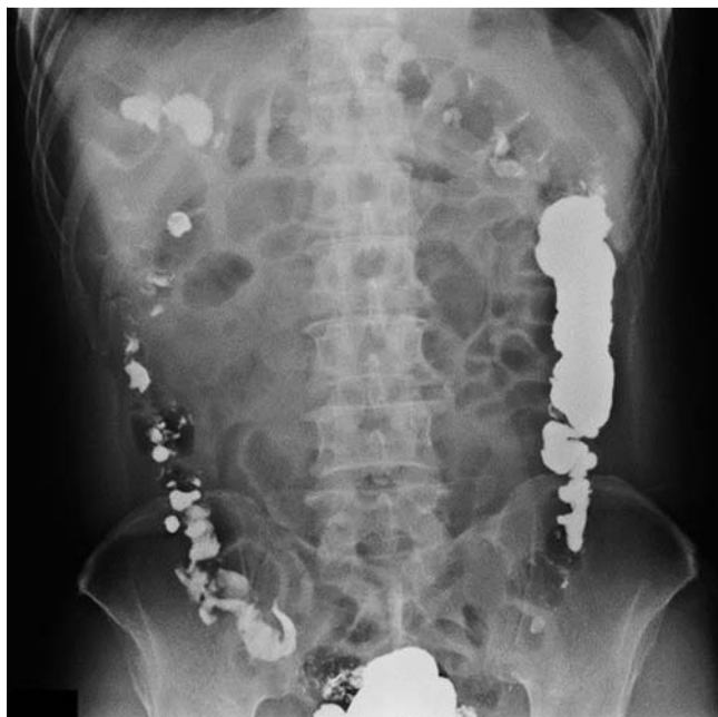
Fig. 3 Abdominal radiography on the day following treatment showing barium remnants in the diverticulum.

ceived barium impaction therapy using an enteroscopic overtube with balloon after endoscopy to rule out intestinal mucosal damage due to Crohn's disease, ulcerative colitis, ischemic enteritis, intestinal tuberculosis, intestinal Behcet's disease, or infectious enteritis.