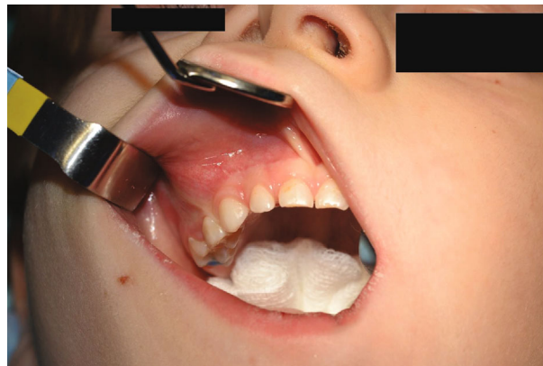
FIGURE 1: Intraoral view on the operative region.

Three weeks after surgery, the wound was completely healed. The patient did not report any complaints. The result of histological examination as radicular cyst was presented to the patient's parents. These results illustrated a cystic lumen,