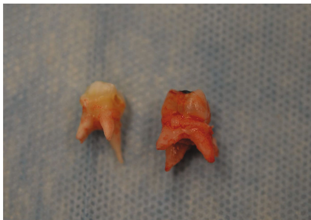
FIGURE 3: Teeth 54 and 55 removed.