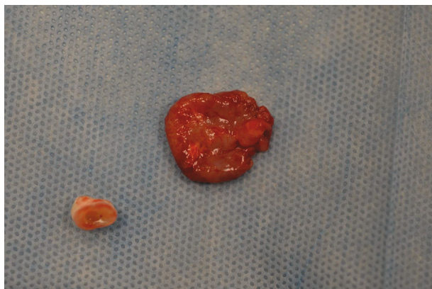
FIGURE 5: Cyst and tooth 15 germ.