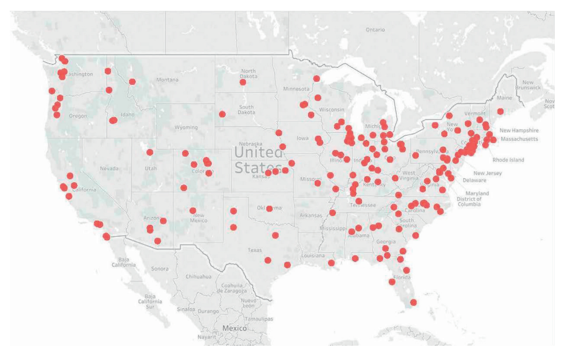
FIGURE 1: Map of respondents from outpatient cancer centers across the US. The map depicts the location of the 215 cancer centers providing complete data for use in analyses. Forty-three states were represented, including centers from all geographic regions of the continental United States.