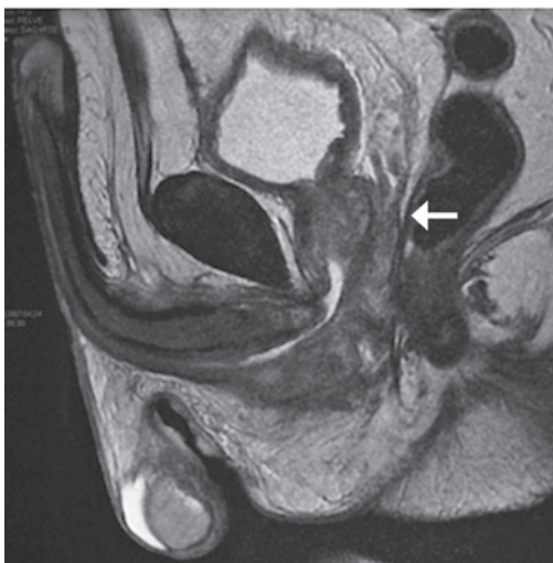
Figure 1. Nuclear magnetic resonance of the pelvis showing the urethral tumor (arrow)

The anatomopathological study showed a high histological degree pleomorphic sarcoma, measuring approximately 20.0cm, in the bulbar urethra with neoplasia affecting the bladder base, periprostatic region, seminal vesicles, base of the penis and cavernous bodies (Figure 3). The urethral tumor had high cellularity, high mitotic index, 30% necrosis of tumor volume and intense anaplastic effect. The perivesical surgical margins and the right ureter was compromised. The left urethral margin was free of malignancy. No metastasis was observed in 15 dissected lymph nodes in the pelvic