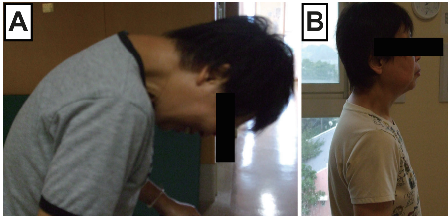
Figure 1. A: The patient showed drop head syndrome (DHS) at an angle of 90° from the vertical line at admission time. B: Her DHS had completely recovered after four weeks of prednisolone treatment.