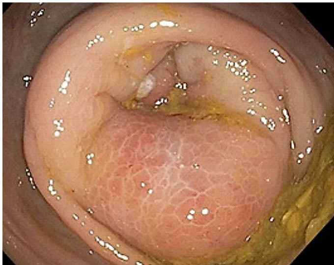
Fig. 1. Large circumferential lesion in the rectum.