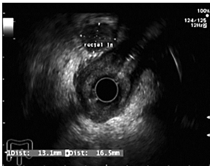
Fig. 3. Enlarged perirectal lymph node.