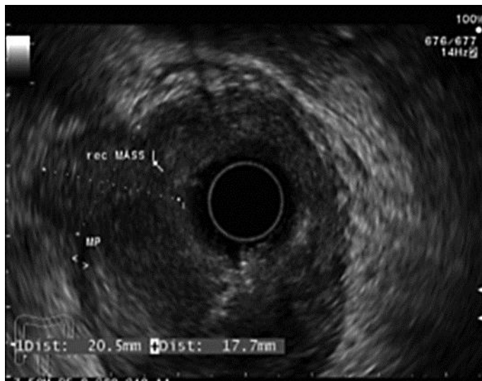
Fig. 2. Hypoechoic rectal mass extending into the muscularis propria.