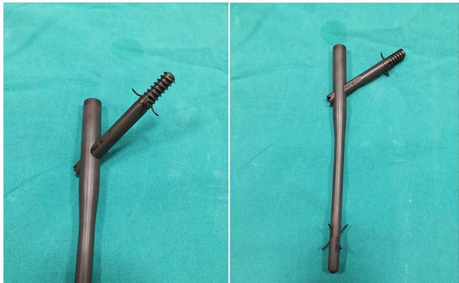
FIGURE 1: The Talon™ DistalFix™ nail.

Four retractable anchors and the lag screw of the proximal femoral nail.