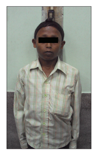
Figure 2: Profile of the patient showing short stature, with pre-pubertal facial features; Stadiometer showing sever short stature (height 133 years at 27 years age)