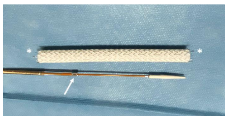
FIGURE 3: Solaris self-expanding covered stent. Arrow: antijumping system; asterisk: tantalum proximal and distal marker bands at uncovered stents at the ends.

encapsulating a nitinol stent structure with instantaneous sealing, and minimal shortening during deployment with an accurate delivery system (Figure 3). The pull-back hydrophilic delivery system provides superior navigability, and its antijumping system guarantees accurate deployment during the procedure. The Solaris device is configured in diameters of 6 to 9 mm and lengths of 40 to 100 mm. This stent graft has been used for the treatment of vascular trauma, aneurysmal disease, and occlusive peripheral disease.