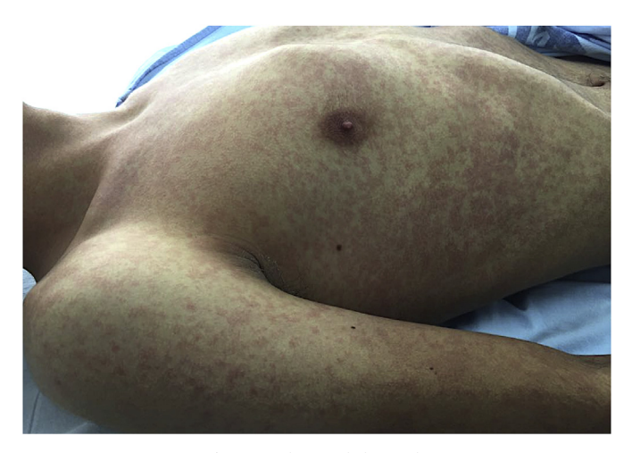
Fig. 1. Widespread skin rash.

included (day two): Epstein-Barr Virus, IgG positive; IgM negative; IgG Herpes Virus, positive and IgM, negative; HIV, negative (duplicated).