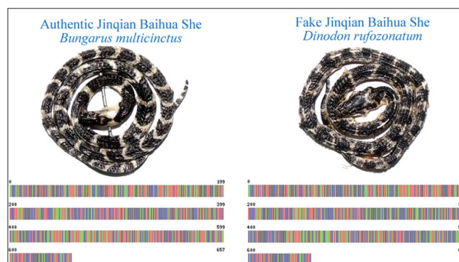
Figure 1: Authentic Jinqian Baihua She and one of its adulterants derived from Dinodon rufozonatum , and their COI barcodes

Thermal cycling was performed with an initial step at 93°C for 5 min and 55°C for 2 min, followed by 35 cycles of