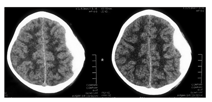
Figure 1: Preoperative computed tomography scan of a patient showing right parietal region extradural hematoma