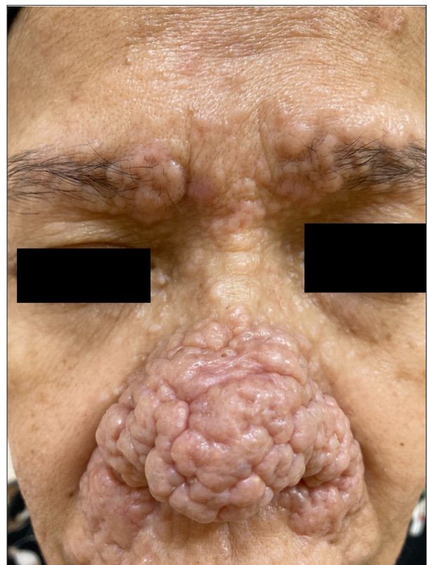
Figure 2. Closer view of multiple rounded whitish and skin-colored papules and nodules on the nasal and perinasal areas, eyebrows, and forehead.