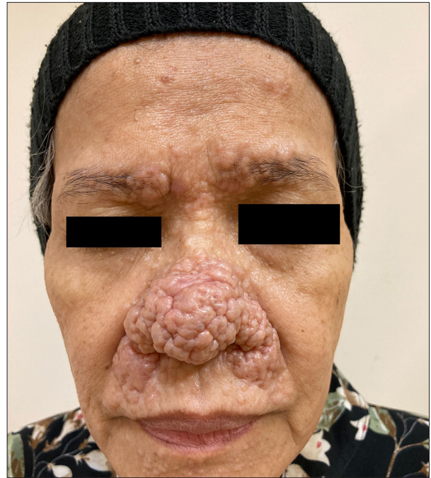
Figure 1. Multiple rounded whitish and skin-colored papules and nodules symmetrically distributed on the nasal and perinasal areas, eyebrows, and forehead.

On further questioning, she said that these lesions had initially developed 30 years earlier and had gradually become more widespread. They did not affect her breathing or sense of smell. Her relatives and friends kept commenting about them, and wherever she went, everyone would stare at her. She admitted to having low self-esteem because of these disfiguring lesions. She subsequently underwent laser therapy at a private medical clinic. Unfortunately, the lesions did not improve so she decided to discontinue the treatment as it was quite costly.