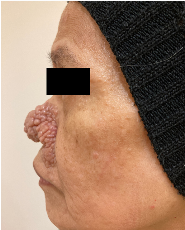
Figure 3. Numerous skin-colored papules on the left side of the patient's face, most prominent on the nose.