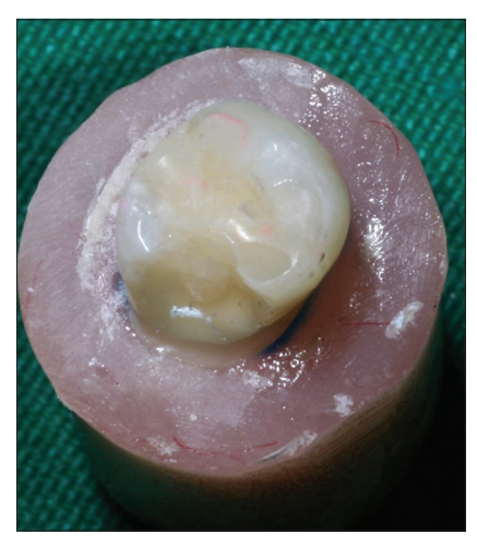
Figure 2: Restorable fracture.

The present study evaluated the FR of ETT with MOD cavities and intracoronally (no cuspal coverage) restored with different types of composite resins reinforced by fiber. Although cusp coverage is recommended as the definite restoration in ETT, we used intracoronal restoration to mimic a clinical scenario in which ETT cannot be restored permanently like in case of endodontic or periodontal problems. In the maintenance phase, preservation of restored ETT with no catastrophic fracture is an important issue. It is evidenced that cusp fracture is one of the main reasons for loss of ETT. In this study, we used TB as the bulk-filled material, because of its