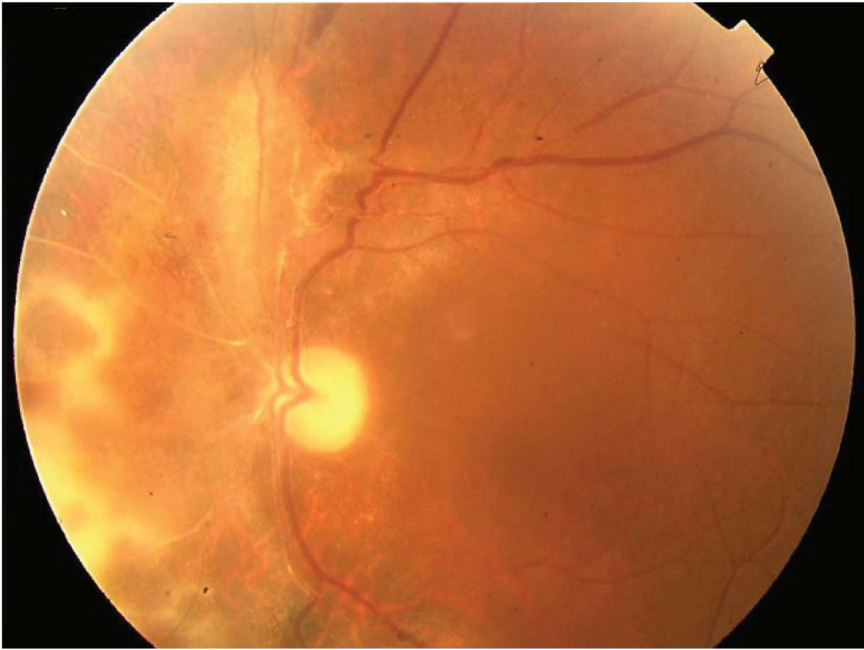
Figure 2 Regression of retinitis following treatment with ganciclovir, leaving retinal pigment epithelial changes and pale optic disc.

retinitis may present with less typical manifestations making the correct diagnosis more challenging. Prompt treatment with administration of antiviral agents is mandatory for the arrest of retinitis progression, earlier rehabilitation and prevention of more sinister complications.