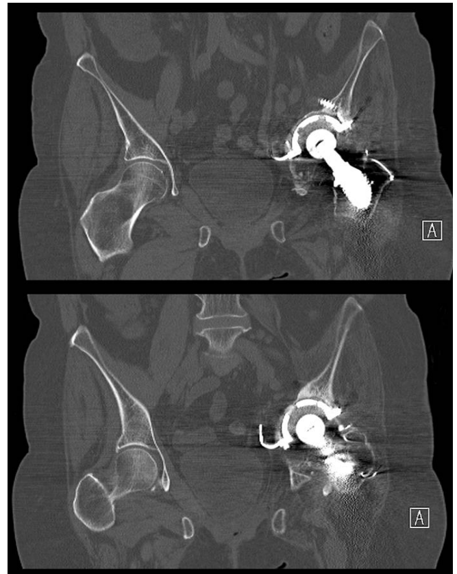
Fig. (3). Conventional CT scan preoperatively without contrast agent.

The initial conventional CT-scan revealed the close proximity of the anchoring hook to the urethra, consequently a continuative contrast agent based CT scan was performed, which demonstrated the urethra looped around the hook of the reinforcement ring. No other relevant soft tissue encroachment was noted and an appropriate pre-operative plan was performed accordingly (Figs. 4, 5).