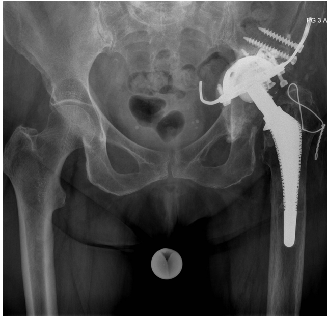
Fig. (1). Pelvis AP identifying the migration of the reinforcement hook into the pelvis.

Plain radiographs demonstrated the protrusion of the reinforcement ring into the pelvis and complete migration of the anchoring hook into the pelvis with close proximity to the anatomic structures and other major soft tissue structures. There was no evidence of stem loosening or migration noted (Figs. 1, 2). Based on these findings and particularly the position of the anchoring hook and close proximity to intrapelvic structures, a CT scan was performed (Fig. 3).