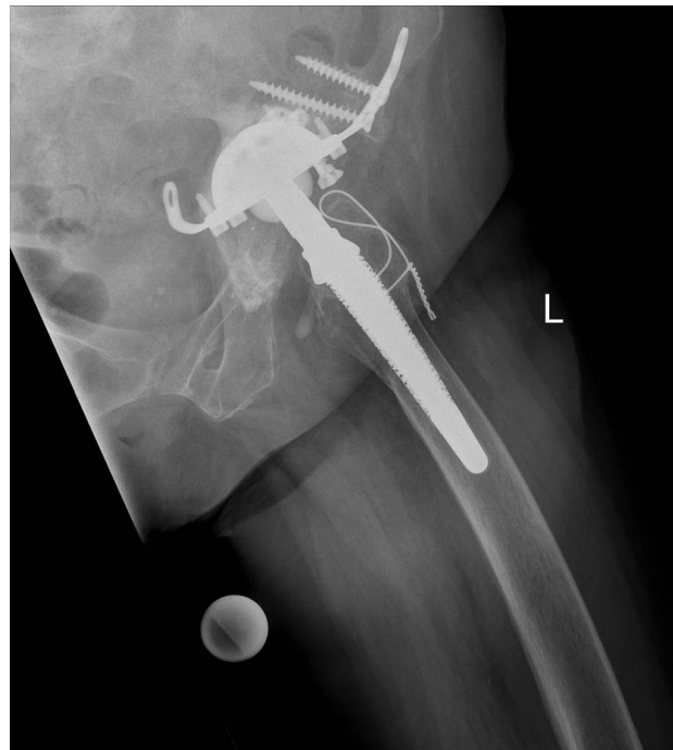
Fig. (2). Lateral view preoperative.