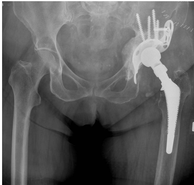
Fig. (6). Pelvis AP final result with a complete reinforcement ring and combined allograft impaction grafting to stabilise the all-polyethylene cup.

The same applies to modern MRI sequences; the musculoskeletal radiologist can alter the technical imaging parameters in the setting of orthopaedic implants, producing diagnostic images for the evaluation of the regional osseous and soft tissue structures [9, 14].