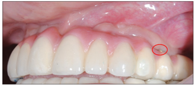
Figure 4: Gum recession around tooth number 25, revealing metal exposure and gap formation

The mean number of grafted tooth sites in the CTG group was 5 \pm 2.0 . Based on the number of grafts received, the majority of the patients (56.60%) had six, seven or eight tooth sites grafted. A significant proportion of the 53 patients (87%) needed soft-tissue augmentation at the canine teeth (no. 13 and 23), P < 0.001 . The lowest proportions of CTGs were