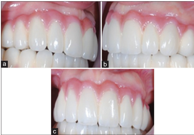
Figure 3: (a-c) 1-year and 6-month post-operative appearance, showing a good adaptation of healthy augmented mucosa to the margins of the prosthesis