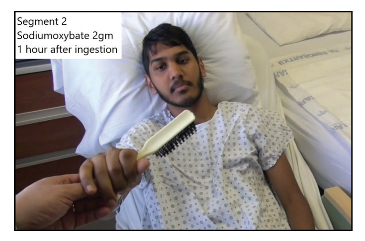
Video 1. Clinical Presentation of the Patient Described in the Paper before and after Treatment with SBX. The first part of the video documents our patient's baseline examination. There is prominent myoclonus at rest and with action. The second part of the video presents the clinical outcome after 1 hour of administration of SBX 2 g. Myoclonus at rest is abolished, and there is significant improvement of action myoclonus.