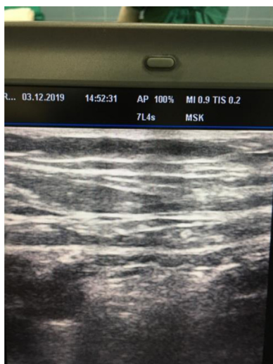
Figure 2 US image taken during the TAP block procedure.

lateral inguinal hernia repair were included in the study. A total of 80 patients who fulfilled the inclusion criteria of our study were randomized into two groups. The inclusion procedure is shown in Figure 1.