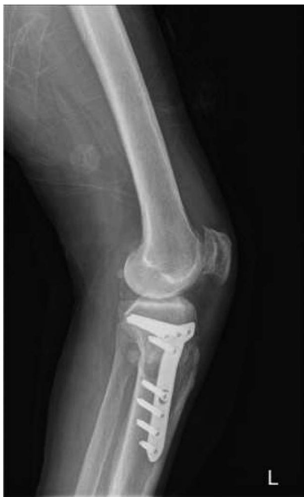
Figure 3. The protruding screw was replaced with a shorter one 3 weeks after the initial surgery.

the extensor digitorum brevis showed decreased amplitudes (0.2 and 4.5 mV on the left and right sides, respectively) and delayed latency. Even if the NCS for the left deep peroneal sensory nerve showed no definite abnormality at this time, the combined results of the NCS and physical examination indicated severe axonotmesis in the left DPN. Thus, we were confident of the DPN damage and decided to change the screw to the shorter screw to remove any possible cause of nerve compression (Fig. 3). The follow-up NCS was performed 42 days after the surgery. The left common peroneal nerve motor conduction study recording the extensor digitorum brevis showed decreased amplitudes (0.2 and 4.5 mV on the left and right sides, respectively) and delayed latency. The follow-up sensory NCS for the left DPN showed decreased amplitudes (2.1 and 5.1 \mu V on the left and right sides). The needle electromyography indicated positive sharp waves and fibrillation potentials at rest in the left extensor hallucis brevis and extensor digitorum brevis muscles. Single interference patterns in the left extensor hallucis longus were observed at maximal volition. The motor unit action potentials were not observed in the left extensor digitorum brevis at maximal volition. These electrodiagnostic studies were consistent with left deep peroneal neuropathy, at the level between the tibialis anterior and extensor hallucis longus, with moderate axonotmesis.