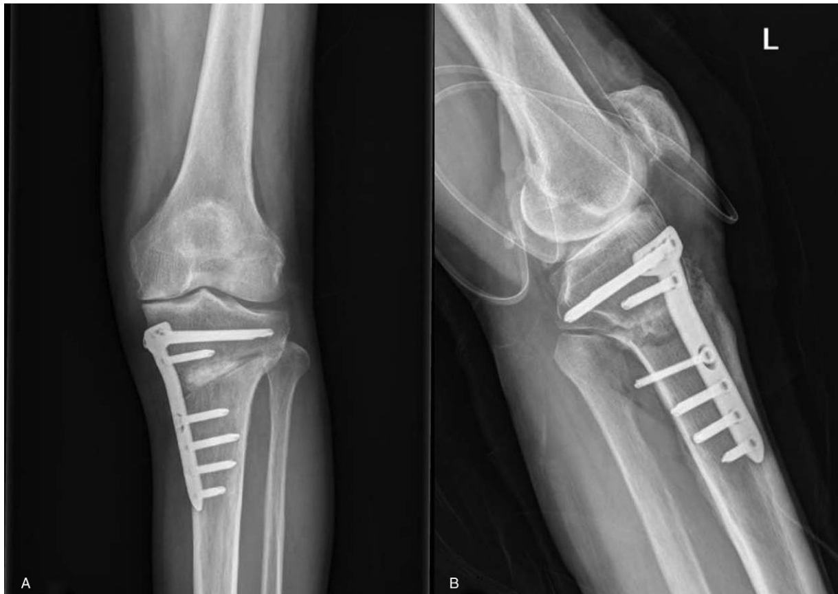
Figure 1. (A) The opening wedge high tibial osteotomy was performed using a locked plate. (B) On lateral projection conventional radiograph, the first distal screw was protruded towards the posterolateral aspect of proximal tibia.