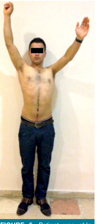
FIGURE 5. Patient was able to elevate his arm more than 160 degrees but apparently with external rotation of shoulder.