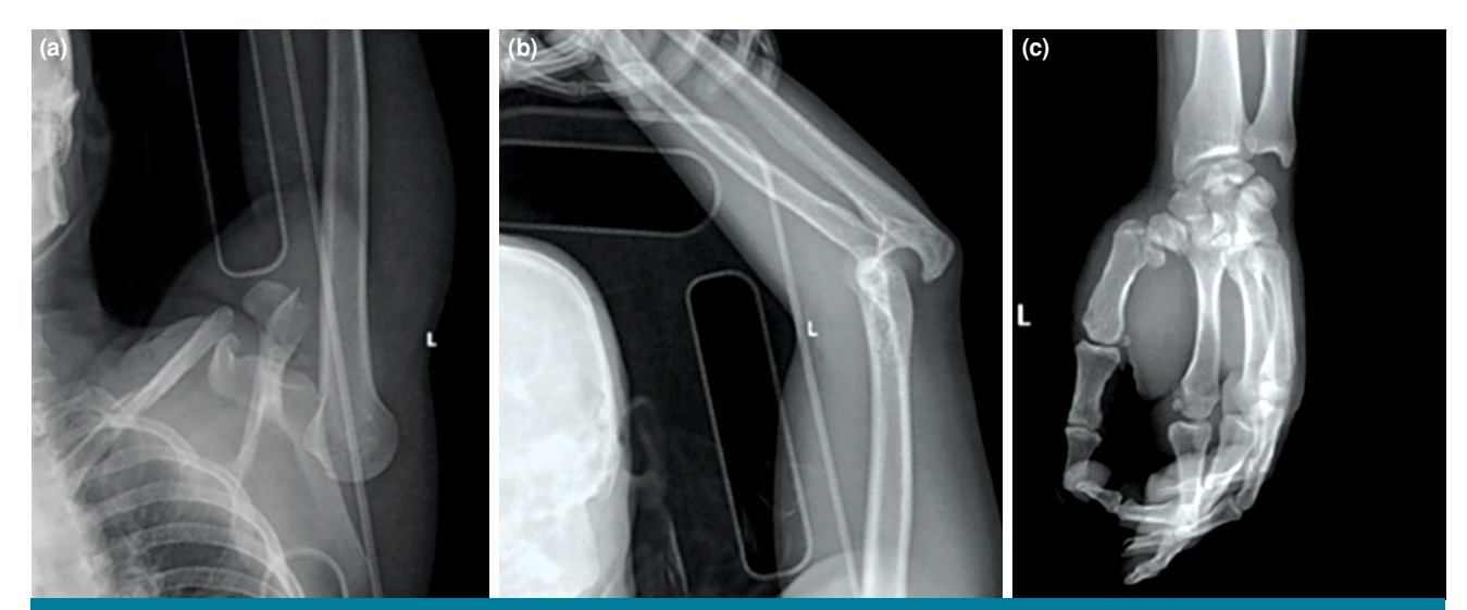
FIGURE 1. Initial X-rays of left shoulder, elbow and hand. (a) Inferior shoulder dislocation and clavicle fracture. (b) Posterior dislocation of elbow. (c) Scaphoid and Bennett fractures.

Radiological evaluation revealed the diagnosis of inferior shoulder dislocation and posterior elbow dislocation (Figure 1). There were also fractures of clavicle, scaphoid, base of the first metacarpal extending into the carpometacarpal joint (Bennett fracture) all in the same side (left) and calcaneus fracture at the contralateral side. The emergency physicians ordered a whole body computed tomography (CT) as it is considered a routine workup for multi-trauma patients to detect possible soft tissue injuries of the chest and abdomen. Considering the situation, the senior surgeon (first author) decided to reduce elbow and convert the inferior shoulder dislocation into an anterior dislocation straightaway while patient was still on the X-ray table without administering any medication as it would have had caused delay. Standing at the head of the table,