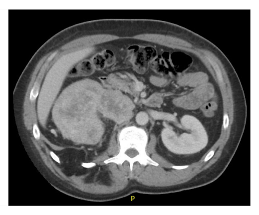
FIGURE 1 Pre-nephrectomy CT showing multiple right renal masses with tumor thrombus extending into the right renal vein and around the IVC.