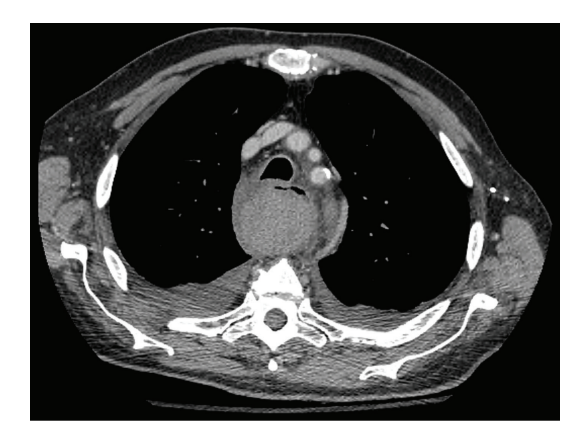
FIGURE 3: Repeat CT scan of a Posterior Mediastinal Hematoma measuring 4.6 \text{ cm} \times 4.6 \text{ cm} \times 18.5 \text{ cm} , two days after patient presentation to MGH.

against restarting the patient's Coumadin therapy, instead electing manage his atrial fibrillation via rate control with Metoprolol. The patient was discharged home on HD eight with instructions to return to the nearest Emergency room if symptoms worsened. Follow-up CT scans were scheduled in two weeks to assess the resolution of his hematoma. The patient was referred for outpatient hematology follow-up to manage his anticoagulation status.