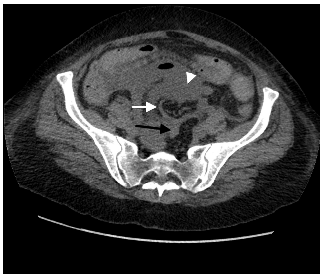
Fig. 2. An axial CT slice from the pelvis at the level of the obstruction. The lack of intravenous contrast hinders interpretation but the dilated afferent (white arrow-head) and collapsed efferent loops (black arrow) at the site of obstruction are shown together with an intervening blind ending structure related to the uterus, which is assumed to be the fallopian tube (white arrow).

inflammatory disease with an intrauterine device in situ but without any previous surgical history.