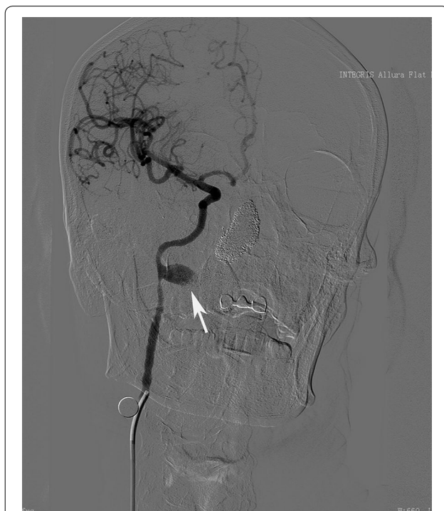
Fig. 1 The angiogram shows a pseudo-aneurysm (white arrow) in the middle part of the right internal carotid artery at the nasopharyngeal level with the adjacent parent vessel, exhibiting moderate stenosis

As CBS was suspected, digital subtraction angiography was performed. A pseudo-aneurysm approximately 17 mm \times 10 mm in size was identified in the middle portion of the right internal carotid artery at the nasopharyngeal level, with adjacent parent vessel stenosis (Fig. 1). As the bleeding was repetitive and massive, we decided to use endovascular treatment. An emergency ICA compression test was performed, and it showed good compensatory blood flow from the Circle of Willis (Fig. 2). We then tried to implant a covered stent,