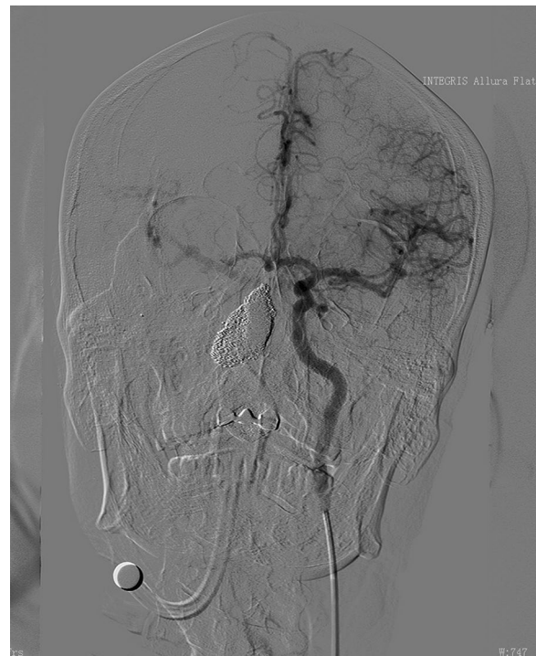
Fig. 2 The angiogram shows good contralateral compensatory blood flow from the Circle of Willis when performing the compression test of the right ICA

which failed because of the narrow lumen. Massive bleeding occurred during the procedure. We immediately occluded the right ICA with coils, and the pseudo-aneurysm disappeared with the bleeding controlled (Fig. 3).