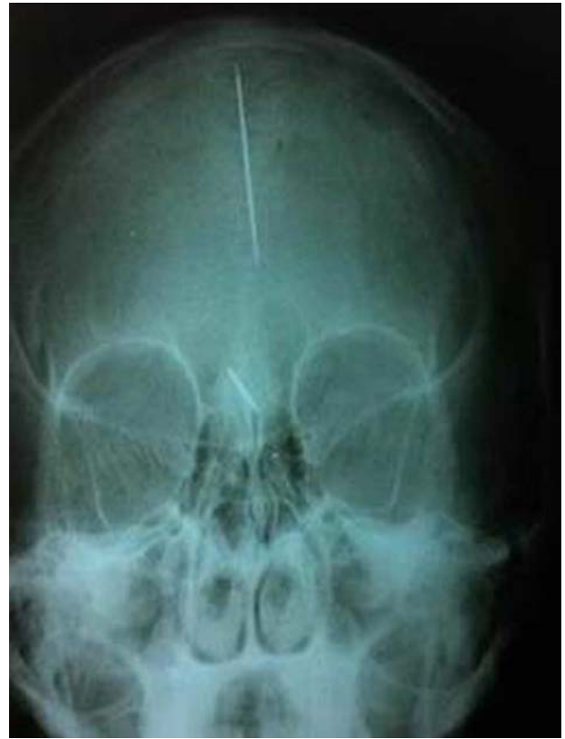
Figure 2. PA Radiograph of the Intracranial Foreign Body

A CT scan was also performed. The patient informed us that she was not aware of the foreign bodies. No areas of intracranial hematoma or encephalomalacia were seen. The asymptomatic nature of the foreign body may be due to the body's typically high tolerance for needle-like objects.