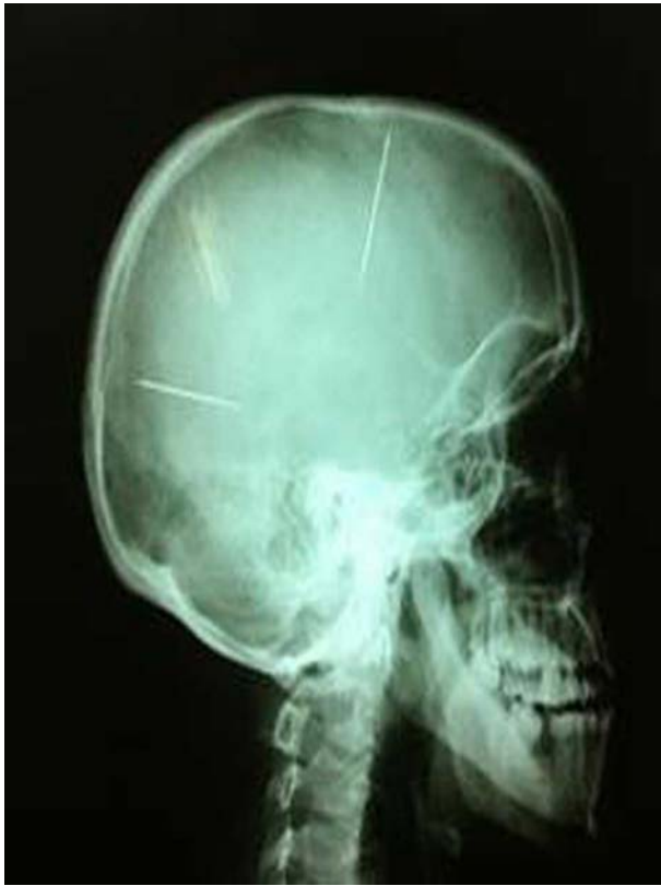
Figure 1. Lateral Skull Radiograph of the Intracranial Foreign Bodies