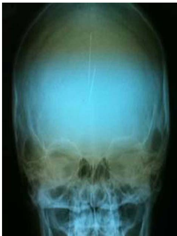
Figure 3. Radiograph of the Intracranial Foreign Body