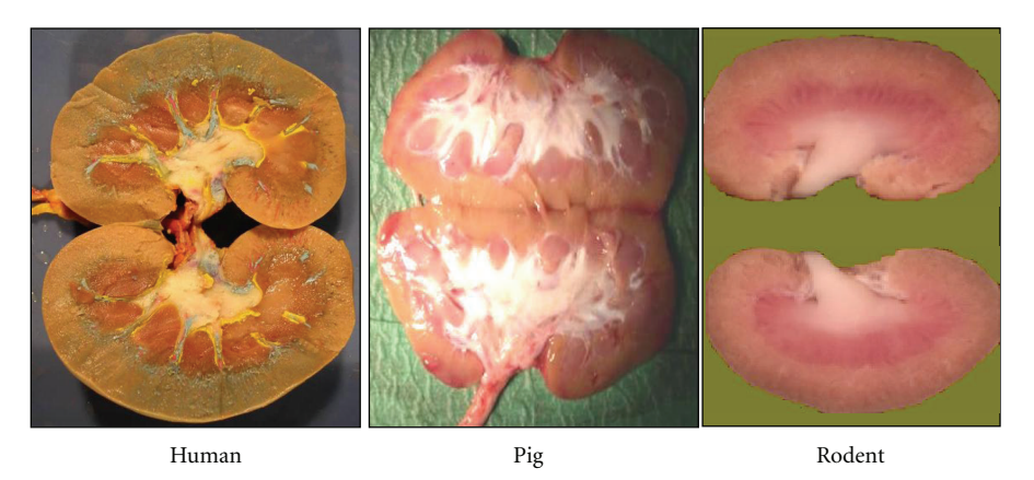
FIGURE 2: Renal anatomical comparisons between human, pig and rodent [26]. Multilobular and multipapillary kidneys observed in human and pig contrast with unilobular and unipapillary kidney in rodent.

O<sub>2</sub>-dependent metabolism linked to oxidative phosphorylation. These cells are living in an oxygenated area making them more sensitive to ischemia. Cells in the outer medulla can shift to O2 independent metabolism, making them less sensitive to an hypoxic environment. Inner medulla and papillae cells predominantly use glucose to generate ATP via anaerobic glycolysis. These last regions reside in a permanent hypoxic environment and consequently are less affected by ischemia [25]. Physiological differences among species limit the clinical translation of animal studies. Criteria related to renal embryology, anatomy, architecture and lymphatic pattern, ability to concentrate urine, and sensitivity to ischemia suggest that the pig kidney may be more similar to the human kidney than dog's or rodent's and may be a better model to study human ischemia/reperfusion consequences [25, 28-30].