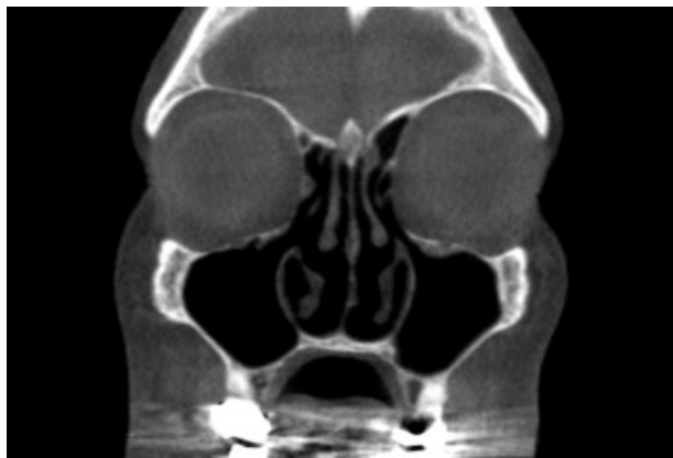
Fig. 5 Sinus CT scan* following suctioning of both maxillary sinuses. Same appointment as ► Fig. 2 . Sinus culture results showed normal flora. The patient was placed on twice daily off-label Budesonide/saline nasal irrigation therapy for 2 weeks with continued nasal saline irrigation twice daily thereafter. There was no recurrence of inspissated mucous at the 9-month follow-up appointment, with resolution of symptoms.

* Three hundred frame scans performed in this study using 0.09 mSev. Xoran MiniCAT™ Low Dose CT (MiniCAT™ Effective dose estimates. 5210 S. State Rd., Ann Arbor, MI 48108).