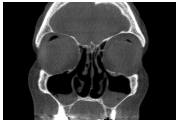
Fig. 4 Three-month postoperative sinus CT scan* frame demonstrating bilateral maxillary sinus air-fluid levels, and the postsurgical changes of the ethmoid surgery. A sinus CT scan was performed because of the maxillary sinus floor inspissated mucous found on nasal endoscopy in ► Fig. 3 . The patient's only symptom complaint was postnasal drainage and cough. Both maxillary sinuses were suctioned of inspissated mucous and sent for culture. Same appointment as ► Fig. 2 . The cultures showed no growth of bacteria. * Three hundred frame scans performed in this study using 0.09 mSev. Xoran MiniCAT™ Low Dose CT (MiniCAT™ Effective dose estimates. 5210 S. State Rd., Ann Arbor, MI 48108).

One observation found with the uncinectomy was improved visualization of and access to the ethmoid sinuses when performing a concomitant ethmoidectomy, because the uncinete process is often medialized with dilation of the infundibular space. As a theoretical problem-solving comment, if concern were to arise that formation of obstructive infundibular space synechiae could occur from mucosal trauma with the balloon device, partial or complete uncinectomy would prevent this from occurring. As aforementioned, the degree of uncinete process removal is determined by the surgeon at the time of the procedure to achieve the desired exposure.