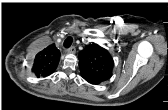
Figure 3 Coronal CT taken three years after surgery. There is no evidence of recurrence or invasion of malignancy.

Decisions regarding therapy for local disease are often affected by whether the patient receives systemic treatment and the response to such therapy. For patients who may need a large resection, systemic therapy is preferable before resection not only to facilitate successful locoregional treatment, but also to eliminate any early metastases. Surgical treatment is useful for controlling pain and ulcers and maintaining the patient's quality of life [21]. However,