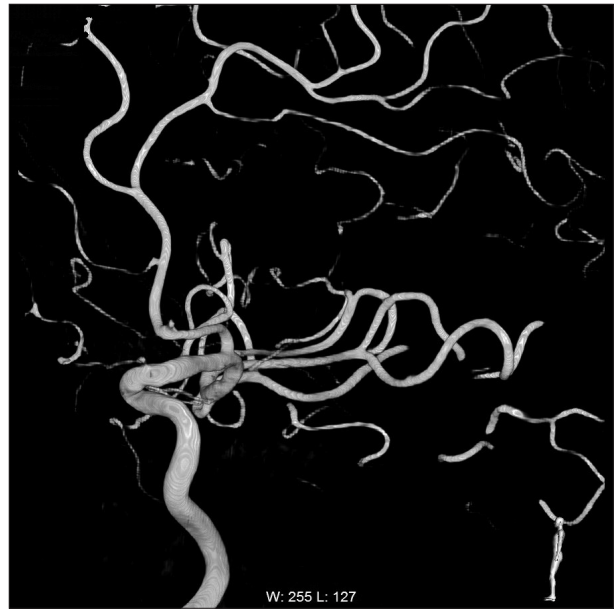
Fig. 1. The 3D DSA showed a blood blister-like aneurysm in internal carotid artery.