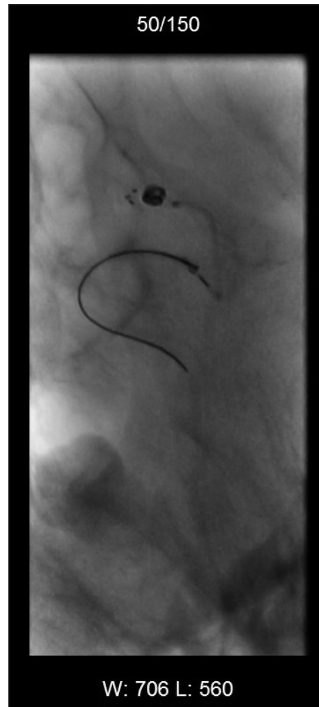
Fig. 2. Only one coil was planted in a really hard way.