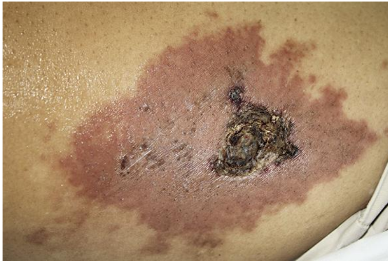
Fig. 1. Serrated purpuric patch on the right thigh, with a superficial central ulceration covered by a hemorrhagic crust.