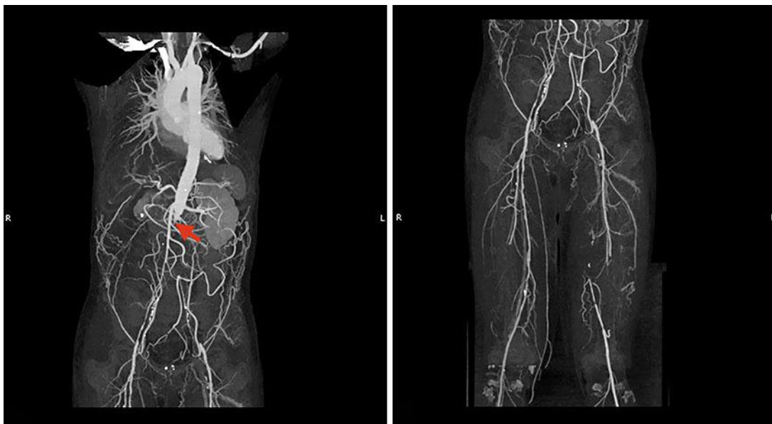
Fig. 4. Computed tomography angiography showing total occlusion of the right infrarenal aorta extending to the aortic bifurcation (arrow), both common iliac arteries and the internal and external iliac arteries.