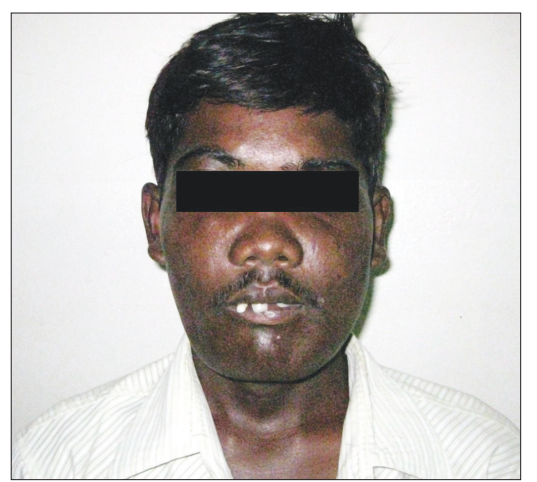
Figure 6: Two-year postoperative follow-up photograph with acceptable esthetics.

SH3BP2 gene mutations cause dysregulation of the Msx-1 gene, which is involved in regulating mesenchymal interaction in craniofacial morphogenesis.<sup>[3]</sup>