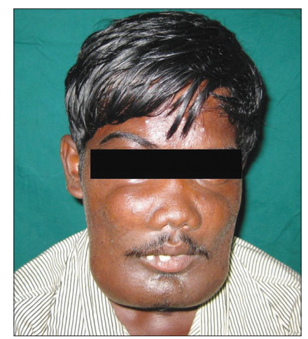
Figure 1: Extra-orally the swellings appeared ovoid in shape, with well-defined borders.

The grotesque appearance and the parent's insistence on esthetic improvement compelled the surgeon to attempt cosmetic surgical recontouring of the jaws under general anaesthesia. The entire mandible and maxilla was degloved intraorally. The exposed lesion tissue consisted of multiple locules with reddish hue and semi-hard consistency. Buccal surfaces of maxilla and mandible were decorticated and curetted as much as possible to provide optimal cosmetic improvement. Impacted and loose teeth were removed. Specimen was sent for final histopathological examination [Figure 5]. The diagnosis of cherubism was confirmed. Patient had no recurrence of the lesion during the 2-year follow-up period [Figure 6].