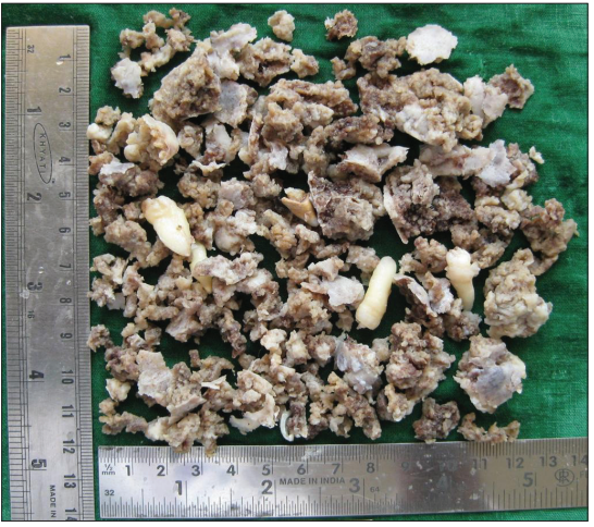
Figure 5: Surgical specimen showing decorticated and curetted material along with impacted teeth.