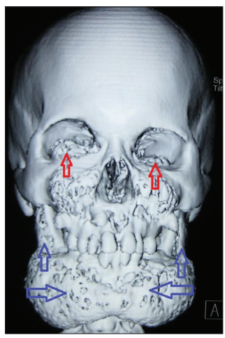
Figure 3: 3-Dimensional computed tomography scan showing multiloculated cystic lesions affecting the body and rami of the mandible (blue arrows) and maxilla with raised orbital floor (red arrows).