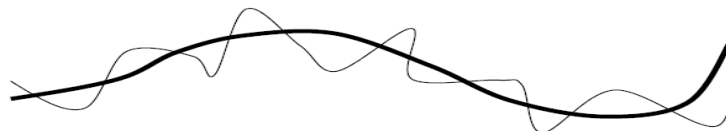
Figure 1. The geodesic as solution of the ODE. With noise, the geodesic is transformed in a more complex structure related to the Fisher information. The total effect is the percolation random geodesic.

Therefore, the electric neural activity can be represented in the manifold state space, where the minimum path (geodesic) between two points in the multi-space of currents is a function of the neural parameters as resistors, with or without memory. Simple cases given by electric activity of a little part of the membrane of axons, dendrites, or soma, thus ignoring the presence of the voltage-gated channels in the membrane, can be done. The power is comparable to the Lagrangian in mechanics (Hamilton principle) or the Fermat principle in optics (minimum time). In the context of Freeman’s neurodynamics, we hypothesize that the minimum condition in any neural network gives the meaning of “intentionality”. A neural network changes the reference and the neurodynamics in a trajectory with minimum dissipation of power or geodesic. Therefore, any neural network, or the equivalent electric circuit, generates a deformation of the current space and geodesic trajectories. For every part of the neural network, it is possible to give a similar electric circuit in this way.