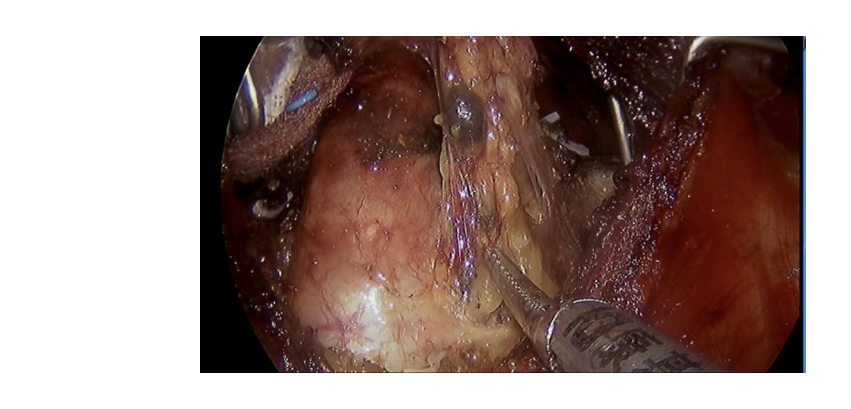
FIGURE 3 Black-stained central lymph node.

A total of 55 patients in the experimental group developed hypoparathyroidism: 54 cases (33.75%) were transient and one (0.625%) was permanent. The single permanent hypoparathyroidism patient recovered normalized PTH secretion 12 months after surgery. In the control group, 39 patients developed hypoparathyroidism: 33 cases (22%) were transient and 8 cases (5%) were permanent. Four of the Eight permanent cases recovered normal PTH secretion 12 months after surgery. The incidence of transient hypoparathyroidism was higher in the experimental group than in the control group; however, the incidence of permanent hypoparathyroidism was higher in the control group. The difference between groups was significant (X2 = 10.255; P = 0.006; Table 1). In univariate analysis, parathyroid autotransplantation increased incidence of transient hypoparathyroidism (OR,1.806;Cl,1.088-2.998; P=0.022),and lower incidence of permanent hypoparathyroidism (OR,0.112;Cl,0.014-0.904;P=0.040) (Table 2).