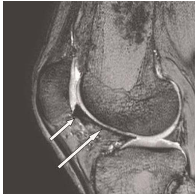
Fig. 4 A T2*-w sagittal image of the right knee obtained with a gradient recalled echo (GRE) pulse sequence. Iron deposits are noted in contact with the inferior pole of the patellae cartilage (short arrow), as well as in contact with the anterior cartilage surface of the lateral femoral condyle (long arrow)

The examination of our case was facilitated by MRI techniques based on the GRE method that allow the visualization of small foci of iron deposits. Such techniques include