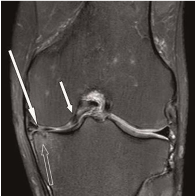
Fig. 1 A fat-suppressed, PD-w image in the coronal plane of the left knee shows a longitudinal tear in the body of medial meniscus (long arrow) and the displaced meniscal fragment within the intercondylar notch (short arrow). In addition, osteoarthritic changes with minimal subcortical cyst formations and reactive bone marrow edema are noted in the medial tibial plateau (open arrow)

‡ Iron deposits assessed by T2* heart measurements range from normal to moderate severity. Heart measurements were obtained from a region of interest prescribed in the intraventricular region