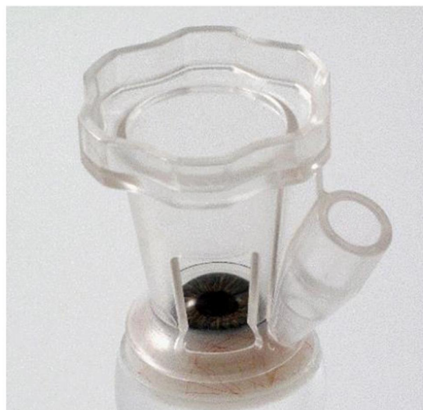
Figure 2 The InVitria.

The InVitria was launched in 2011 and has already received some positive feedback from other units in the