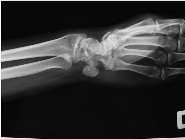
Fig. 1. 30° of supination view of the pisiform before the operation.