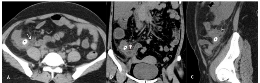
FIGURE 1: Appendicitis and appendicolith

Contrast-enhanced CT abdomen, axial section (A), coronal section (B) and sagittal section (C), of a 38-year-old female patient, presented with abdominal pain and anorexia. CT shows an impacted appendicolith at the base of the appendix (asterisk) with a streak of periappendiceal fluid (arrow), dilated appendix (solid arrow head) and diffuse periappendiceal inflammation (hollow arrowhead).