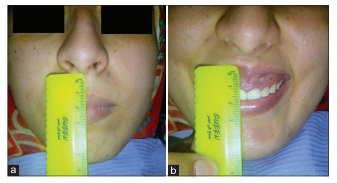
Figure 1: (a) The length of upper lip, when measured from subnasale to the vermilion border was 20 mm. (b) Preoperative image of the dynamic smile, which extends to the mesial aspect of the first molar, showing 5–7 mm of gingival display.

The surgical area was demarcated with the help of an indelible pencil. The surgical area started at the mucogingival junction and extended 6–8 mm superiorly in the vestibule. Incisions were made in the above mentioned surgical area, and both superior and inferior partial thickness flaps were raised from the maxillary left central incisor to maxillary left second premolar. The incisions were then connected with each other on the distal end in an elliptical outline [Figure 2a]. The epithelium was then removed within the outline of the incision, leaving the underlying connective tissue exposed [Figure 2b and c]. The parallel incisions were