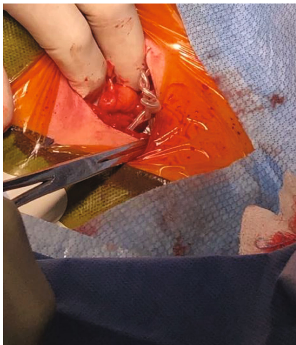
FIGURE 3: Lead wrapping observed during surgical revision.

subcutaneous pocket with a suture in the header of the device to prevent any migration.