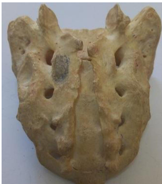
Figure 6 Schematic representation of complete bifida.