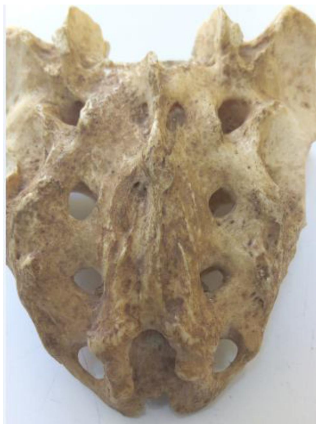
Figure 5 Schematic representation of inverted-U shape of SH.