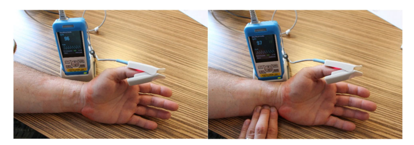
Figure 1 The reverse Barbeau test demonstrating a patent radial artery after transradial catheterization. After the removal of the compression device, which had been placed on the radial artery, blood saturation and the corresponding plethysmographic wave were normal (left). During ulnar compression, the wave and blood saturation do not change, indicating patency of the radial artery (right).

the RBT as the standard detection method of RAO. In addition, we aimed to evaluate radial artery compression time, the incidence of post-procedural haematomas, and other local complications at the puncture site.