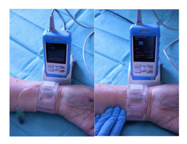
Figure 3 The use of the reverse Barbeau test in the detection of patent haemostasis during radial compression with a TR Band device. When the TR Band is in use, normal oxygen saturation and a triphasic plethysmographic wave are usually detected (left). When applying manual compression on the ulnar artery, the persistence of the curve indicates patent haemostasis (right).

TB was used to facilitate the recanalization of the radial artery.