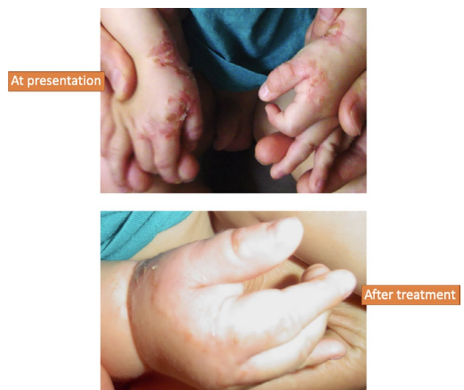
FIGURE 2 Case 2 presentation and treatment result

Pemphigus vulgaris —while the lesions were extensive, the mucous membranes were not affected as happens in