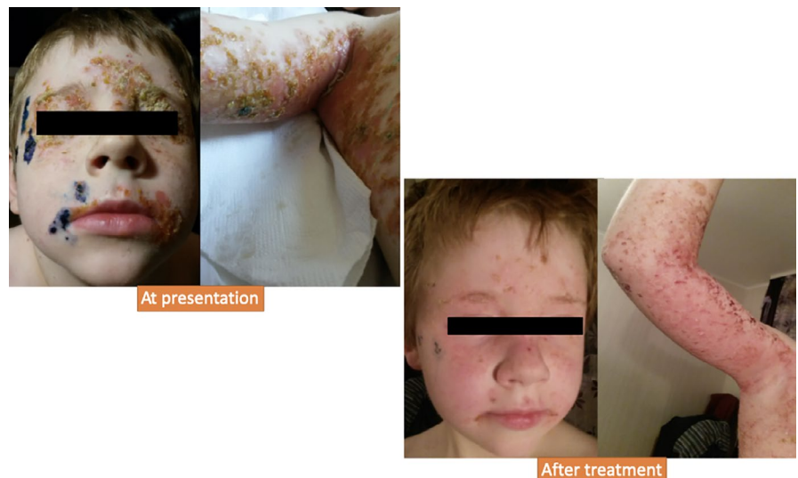
FIGURE 3 Case 3 presentation and treatment result

Diagnosis: In the hospital, the patient was diagnosed clinically with “bullous pemphigoid neonatorum” (BP), and