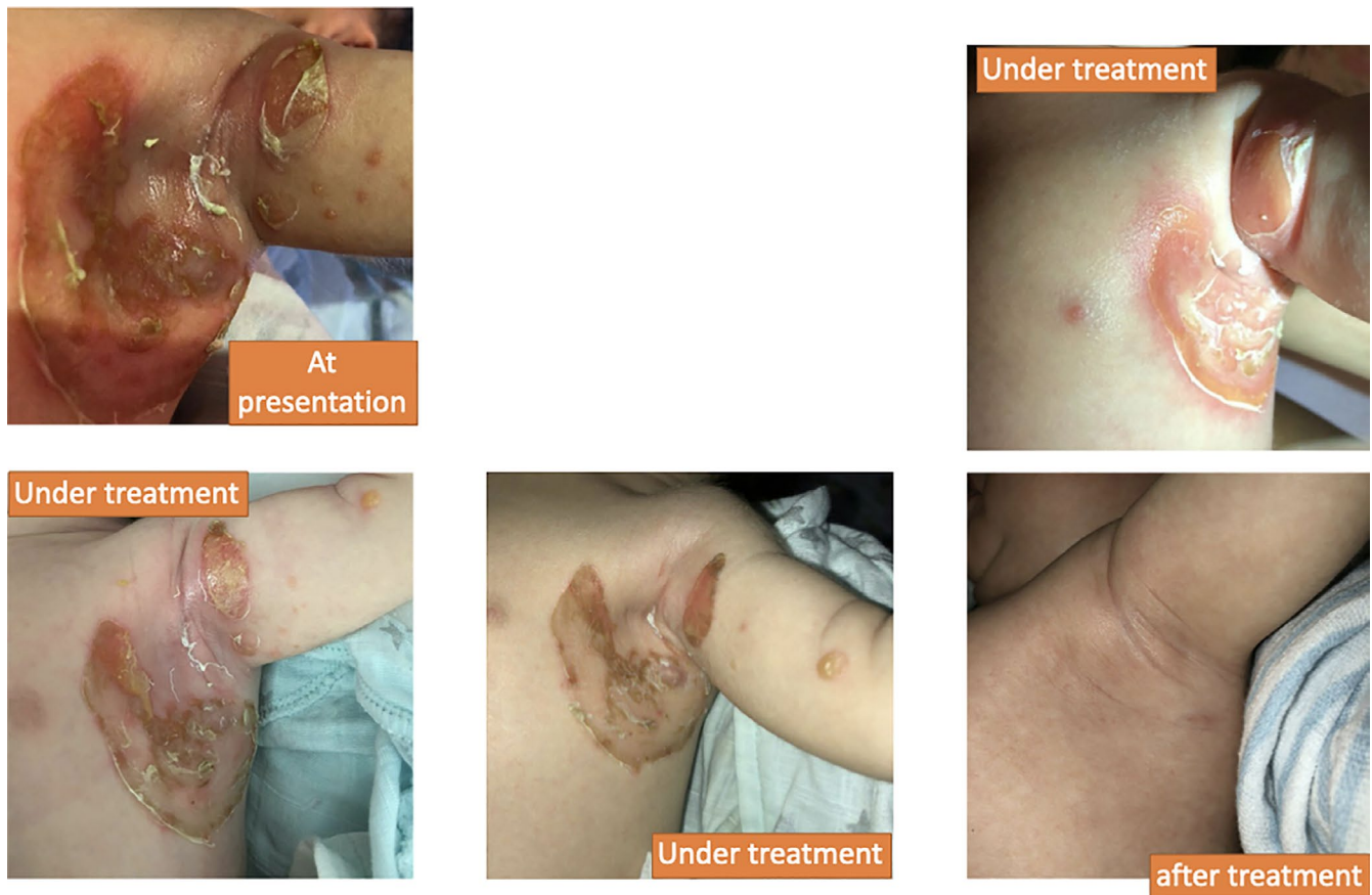
FIGURE 4 Case 4 presentation and treatment result

immediate introduction of intravenous antibiotics for sepsis prevention was recommended. No immunofluorescence investigation was conducted, which would have been desirable to confirm diagnosis.