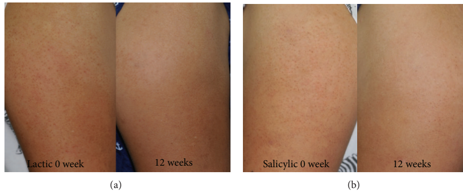
FIGURE 1: Clinical appearance of keratosis pilaris before and after 12 weeks of treatment with 10% lactic cream (a) and 5% salicylic cream (b). They show decreased hyperkeratotic papules at the end of trial.

liquid paraffin, 5.7% propylene glycol, 2% white beeswax, 5.5% sodium lauryl sulfate, and 1% paraben conc.) with active gradient 10% lactic acid or 5% salicylic acid, respectively. They were told to apply the one designated agents twice daily on each of their extensor upper arms by using one hand to apply one test medication to the opposite upper arm and vice versa. The information stored securely for each patient and examining dermatologists were blinded to this information. Patients were reexamined by the dermatologist at 4, 8, and 12 weeks after beginning the study and 4 weeks follow-up phase and any changes in number of lesions were documented in questionnaires designed for this purpose.