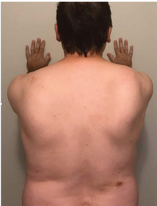
Figure 2: Bilateral medial scapular winging in our patient, worse on the right than on the left. The medial border of the scapula is observed to protrude from the thorax (which may be associated with lateral displacement of the scapula). Medial scapular winging is caused by weakness of serratus anterior due to injury to the long thoracic nerve and is best seen by having the patient push against a wall.

Acute pain followed by weakness involving the AIN, long thoracic and suprascapular nerves suggested neuralgic amyotrophy (NA). We considered cervical radiculopathy to be less likely, given the patient’s weakness in multiple myotomes and absence of neck pain and paresthesia. Testing for vasculitic mononeuritis multiplex showed negative antineutrophil cytoplasm antibodies and normal C-reactive protein. Neuralgic amyotrophy may be provoked by infections. Given the bilateral involvement, elevated liver enzymes and occupational risk factor, we tested only for hepatitis E virus (HEV); HEV immunoglobulin M (IgM) and G (IgG) antibodies were positive. We started the patient on prednisone 60 mg orally daily for treatment of NA, with a 5-week taper. Within 1 week, his pain had resolved.