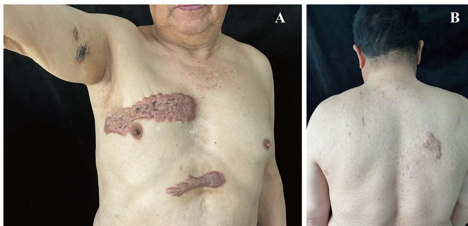
Figure 1 Dermatomal distribution of keloids at the site of healed herpes zoster. (A) The patient had multiple plaques in the right trunk and arm, corresponding to dermatomes T2–T3 and T7, with the largest located in the right chest T2–T3 dermatome, measuring 19 cm (L) × 5 cm (W); (B) The patient had a right dorsal plaque, not beyond the midline.