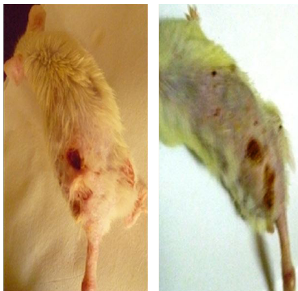
Figure 3. Leishmaniasis Caused by the Infectious L. tropica Strain After the First Passage