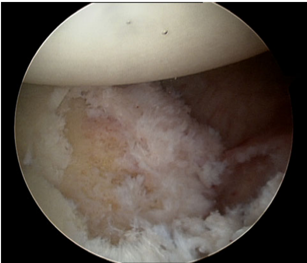
Fig. 1 Glenoid surface after delineating the boundaries of the cartilage lesions