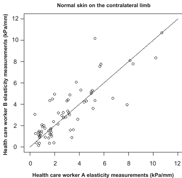
Figure 3: Concordance correlation coefficient (CCC) for elasticity measurements on normal skin on the contralateral limb. CCC = 0.84 (95% CI = 0.75-0.90). Each point represents a patient for which elasticity was measured by both observers.

Statistically significant associations between the elasticity measurements and the MSTs were found, with an elasticity of 7.9 kPa/mm vs. 5.7 kPa/mm for MSTs <30 and \geq 30